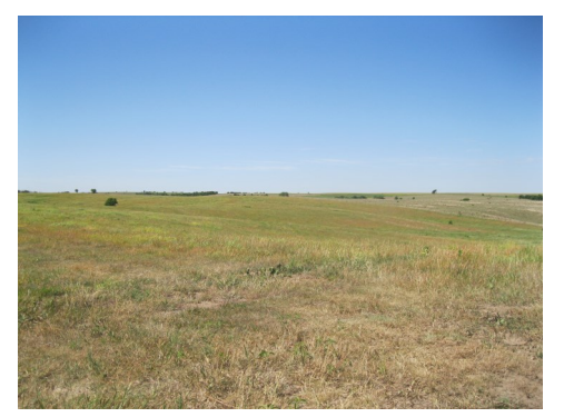
Greater prairie chickens require large areas of prairie for lekking and nesting cover.

threatened ecosystems in North America. Over 98% of eastern Nebraska's tallgrass prairie has been lost. The remaining tracts are small in size and are threatened by further fragmentation, overgrazing, herbicide spraying, and exotic plant, shrub and tree invasion.