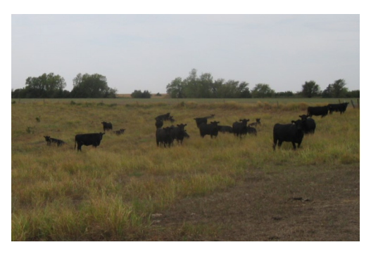
Fields signed up under the Tallgrass Prairie SAFE program through CRP are eligible for haying and grazing according to CRP guidelines.