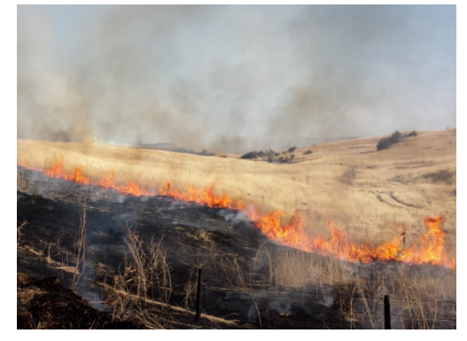
Fields with heavy litter accumulation or an invasion of brush should be burned on a threefive year interval rotation.