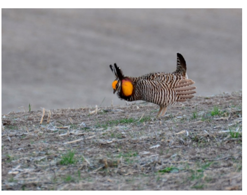
Every spring, male greater prairie chickens perform display rituals and compete to breed with females.

State Acres for Wildlife Enhancement (SAFE) enrollments for prairie chickens accept tracts of land from 40 to 160 acres to reincorporate large blocks of quality nesting and brooding cover on the landscape. Additional wildlife benefits can be achieved by incorporating multiple plantings (eg. nesting cover, broodrearing cover, winter cover) to better meet year round life-cycle needs. Customized seeding designs and an interspersion of cover types will diversify habitat benefits for prairie chickens, other upland game birds, and a host of grassland nesting songbirds.