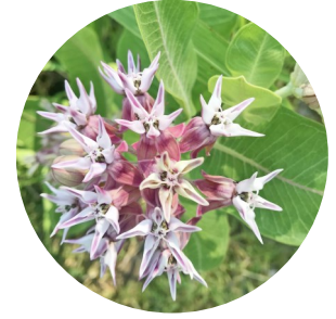
Showy Milkweed Asclepias speciosa