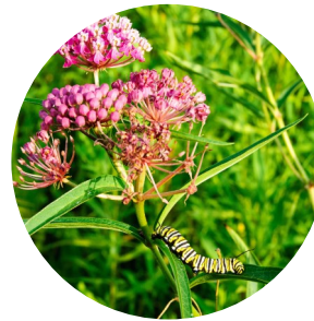
Swamp Milkweed Asclepias incarnata

Recognize any of these milkweeds? Chances are, one of them is growing in nearby habitat. Visit plantmilkweed.org to learn more.