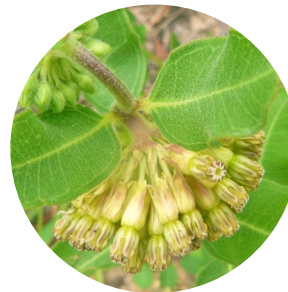
Green Milkweed Asclepias viridiflora