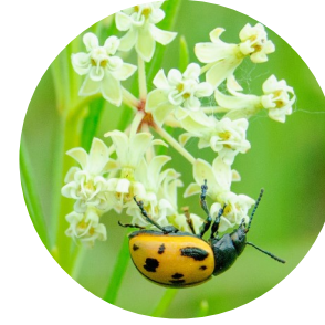
Whorled Milkweed Asclepias verticillata