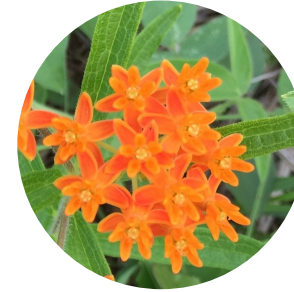
Butterfly Milkweed Asclepias tuberosa