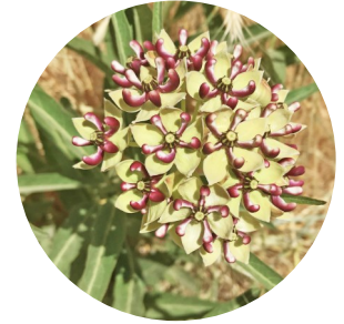
Antelope Horns Milkweed Asclepias asperula